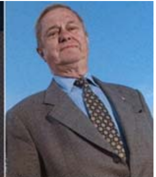
Hougen's Hero: The patriarch of a Yukon business empire speaks out. P18