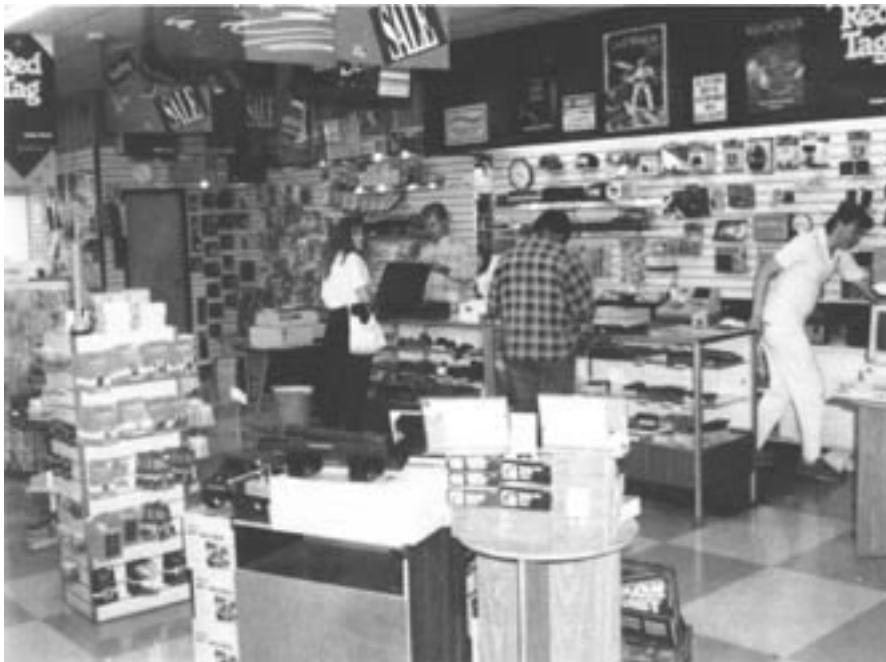
Being president of Hougen's Ltd. allows the chairman to press for changes to the goods and service tax from the perspective of small business

The successful Northern businessman estimates he spends 40 per cent of his time